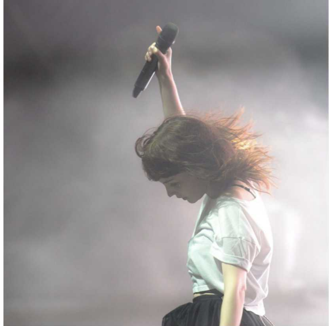
Lauren Mayberry of Churches at The Treasure Island Music Festival in San Francisco, CA 10.18.2015

was abroad. Before her return to the States, she attended Morrissey's first ever solo performance in Wolverhampton, UK after the Smiths had split. The photos from this event weren't winning any awards (yet), but showed a powerful depiction of a musician connecting with his audience. The shots of fans jumping on stage and successfully pulling off Morrissey's shirt were thrilling, and were some of her first photographs that brought the viewer into the lens.