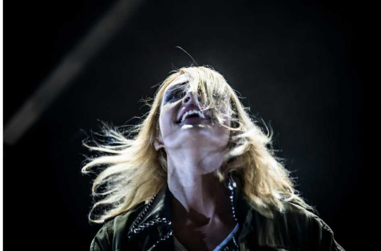
Father John Misty at The Fillmore in San Francisco, CA 1.24.2013