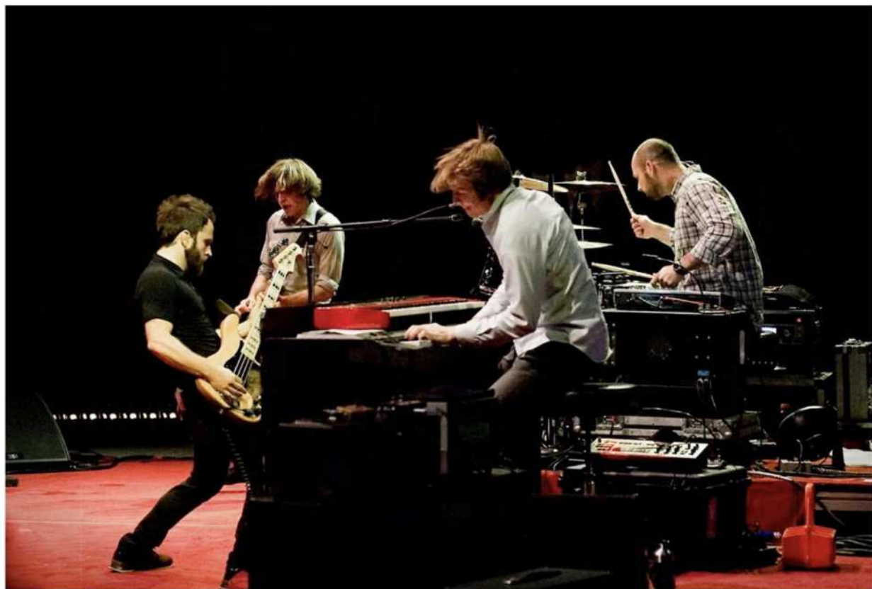
Death Cab for Cutie at The Greek in Berkeley, CA 7.11.2009

“If there has been one constant in my life, It has been my love of live music.”